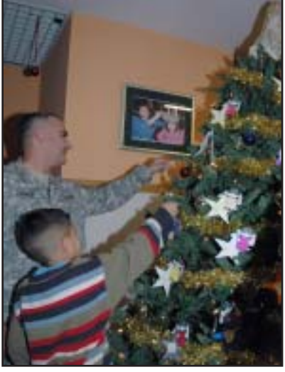
Community members pluck angels off the tree located in Davis Soldier and Family Readiness Center.