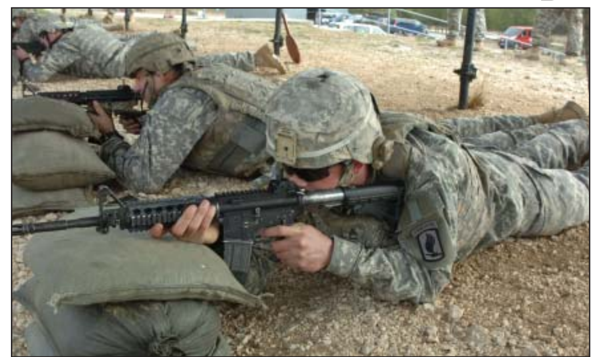
173rd Airborne Brigade Combat Team noncommissioned officers fire their weapons Oct. 23 in Cao Malnisio, Italy, during the marksmanship portion of the basic noncommissioned officers course (BNCOC) that was conducted at Caserma Ederle, in Vicenza Italy.