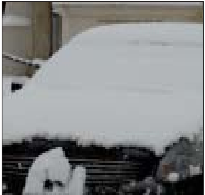
Monday's snow storm caught many Vicenza residents off guard and closed Caserma Ederle.

Directorate of Plans , Training, Mobilization and Security Press Release