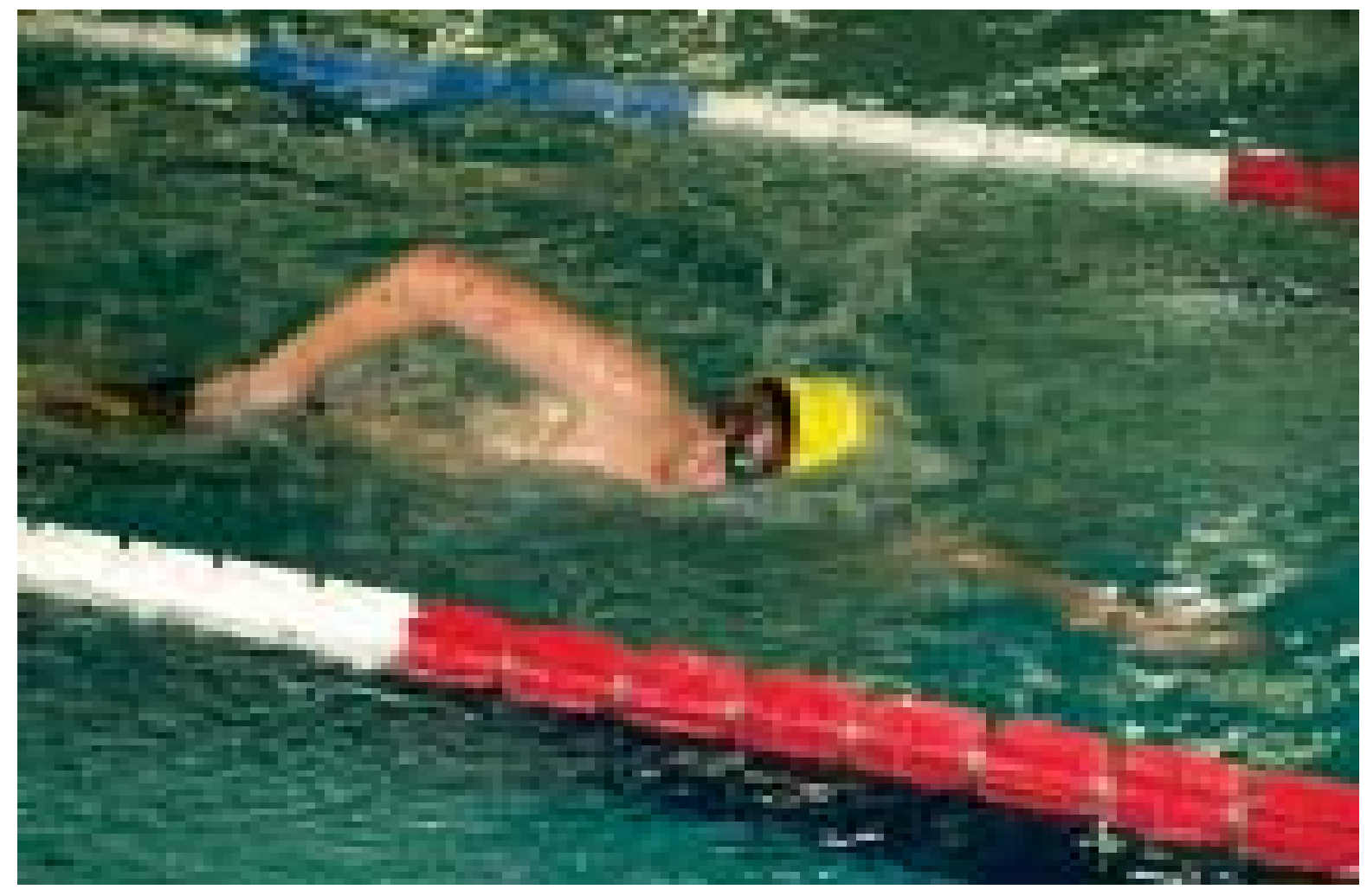
A member of the Mako Sharks swim team competes during the European Federation Swim League meet in Lignano, Italy.